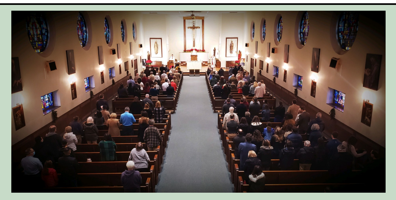
It's nice to be all together and have fuller churches this weekend! Photo: St. Francis 10:00a.m. Mass