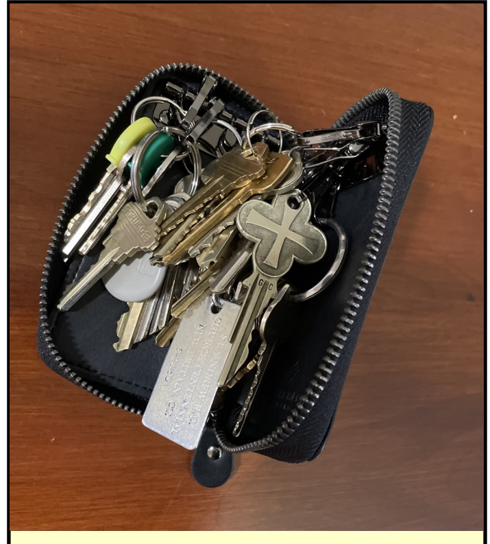
Now, which key goes where......