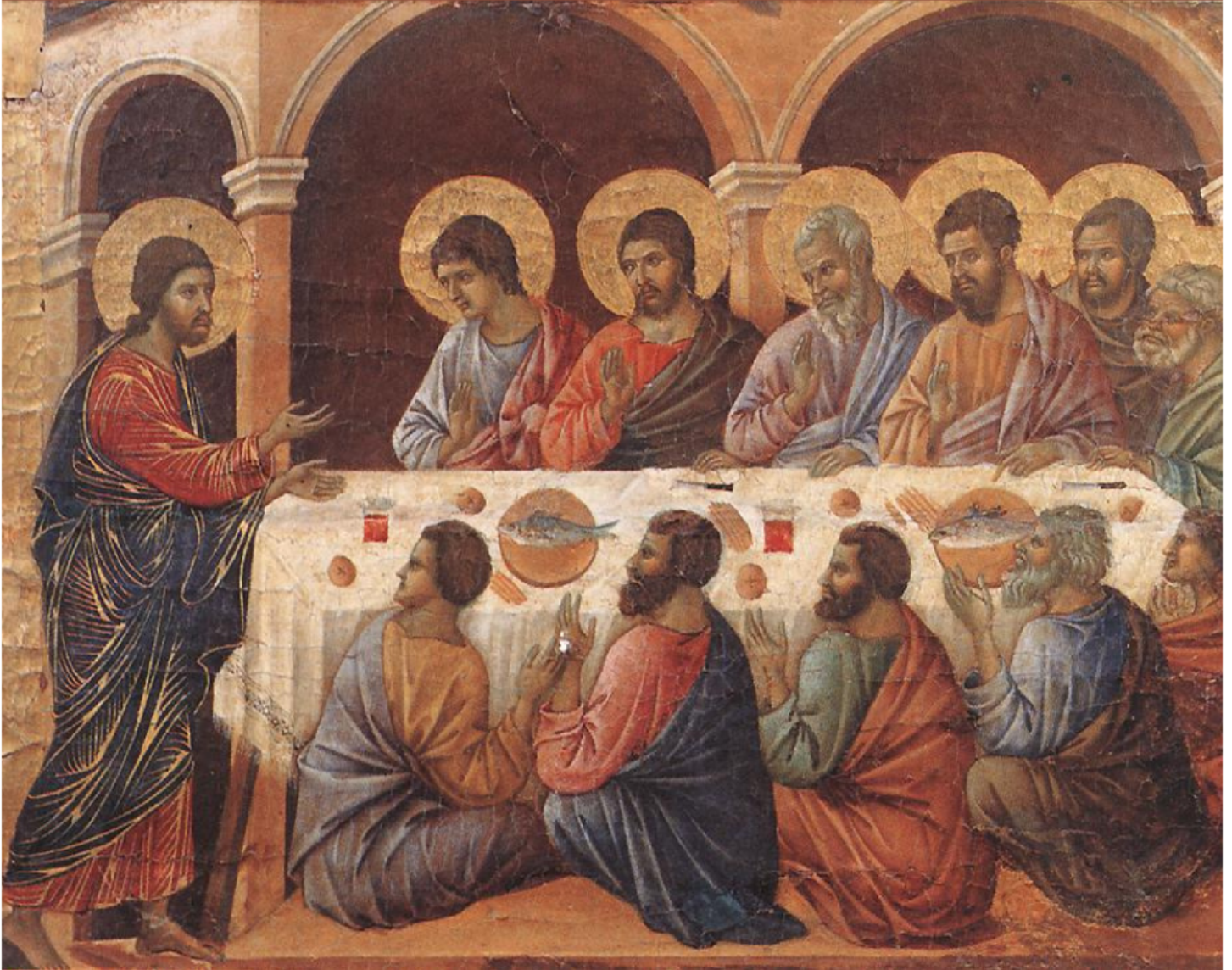
Appearance While The Apostles Are At Table, Duccio di Buoninsegna, 1255-1319, Public Domain Use.