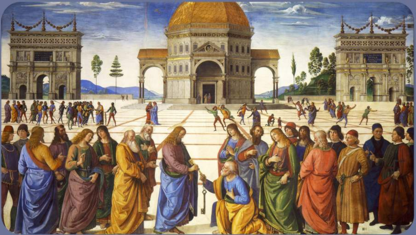
Delivery of the Keys, Pietro Perugino (1481), Sistine Chapel; Public Domain Use

Twenty First Sunday of Ordinary Time August 27, 2023