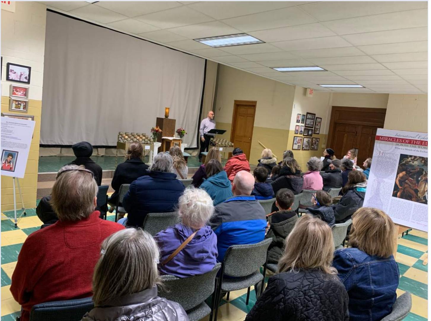
Eucharistic Miracles Exhibition at St. Francis Catholic

Second Sunday of Advent December 4, 2022