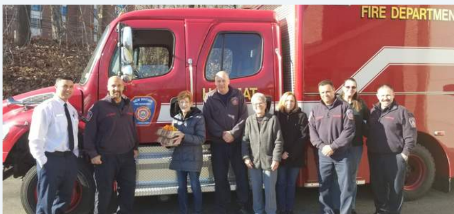
St Joseph's Food Pantry visit the various Fire stations of New Britain