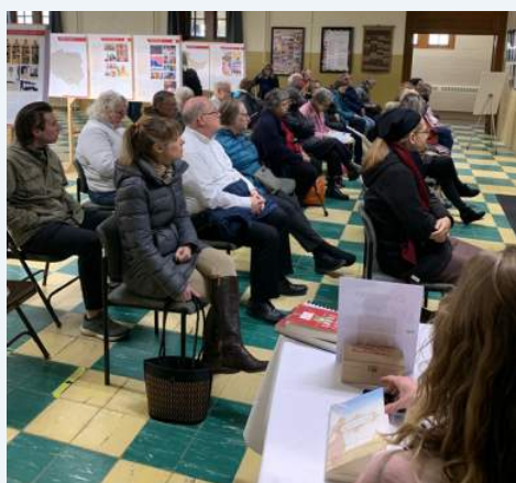
Eucharistic Miracles Exhibit and talk on Blessed Carlos Acutis