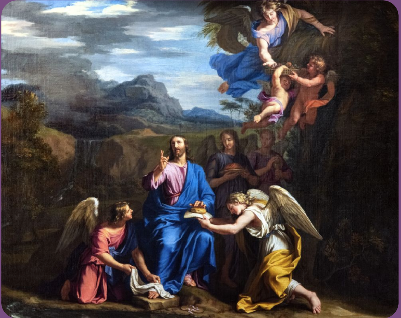
Le Christ au Désert Servi par les Anges (Christ in the Desert Served by the Angels), 1631–1681, Jean Baptiste de Champaigne - Public Domain