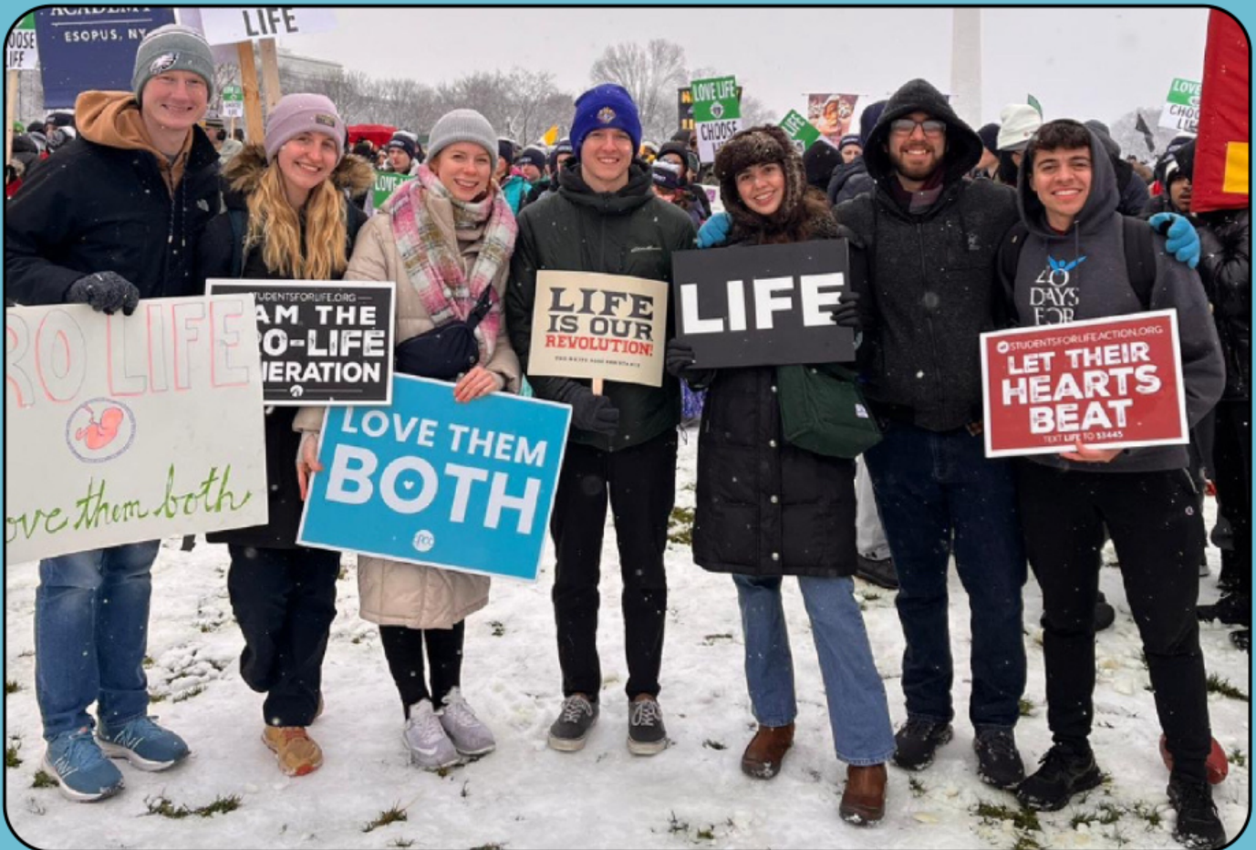
CCSU Students and FOCUS Missionaries attend the 2024 National March for Life in Washington D.C.