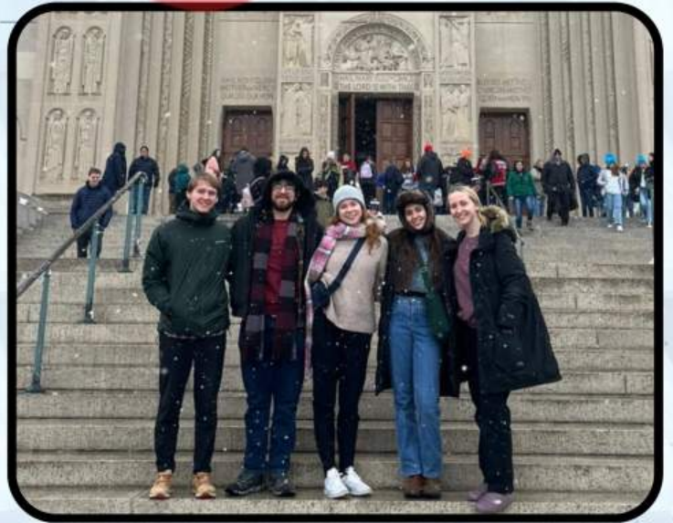
CCSU Students and FOCUS Missionaries attend the 2024 National March for Life in Washington D.C.