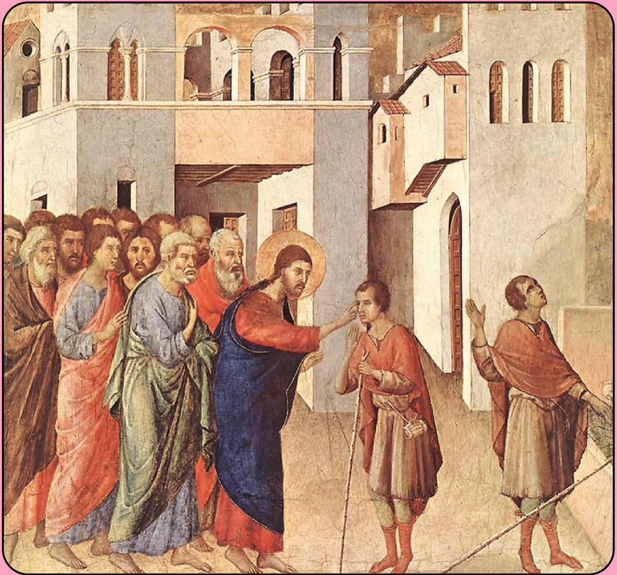
The Healing of the Man Born Blind, Duccio di Buoninsegna, 1255-1319