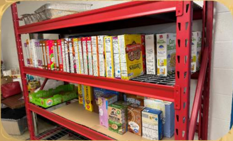
Food Pantry volunteers sort and stock the shelves. Thank you to all who donated cereal following the announcement at Mass!