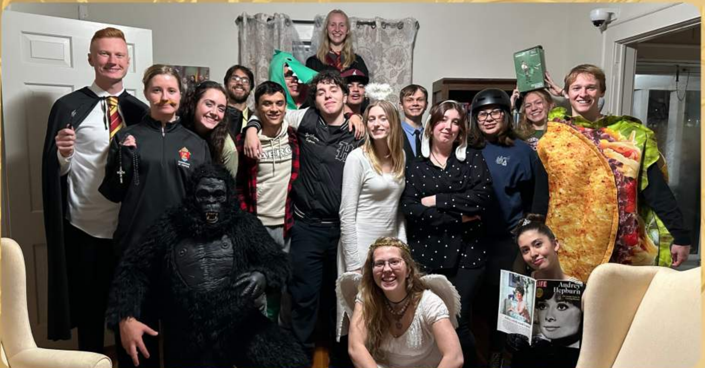
College Students dress up for the 5F Halloween Party!