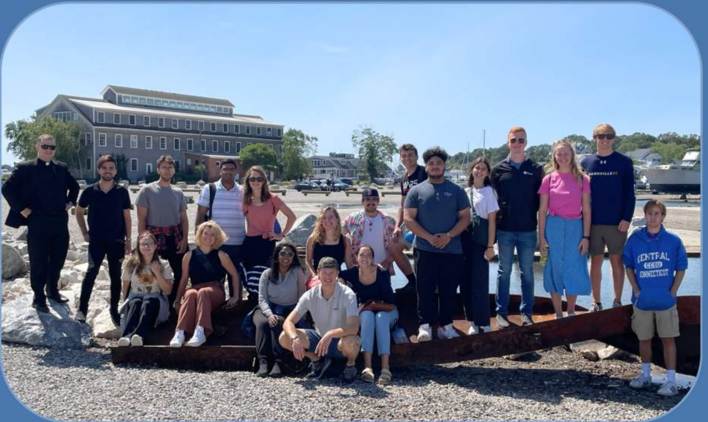
Campus Ministry Kickoff 2023

Twenty-Third Sunday of Ordinary Time September 10, 2023